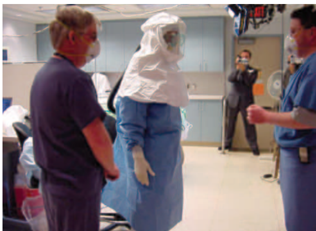
Figure 2. Healthcare worker wearing powered air-purifying respirators for demonstration.

protection against airborne diseases, even if not absolutely required for SARS, will ensure that staff are prepared to deal with future emerging infectious diseases or bioterrorism events that could involve airborne agents.